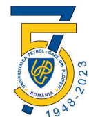
Petroleum-Gas University Ploiești