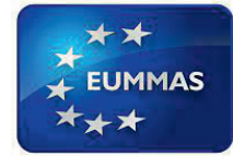
European Marketing and Management Association